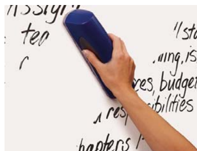
Tekra's Dry Erase Hard Coated Polyester Film erases easily without ghosting.

Tekra offers a 5 mil clear and white gloss dry erase polyester film. In addition, Tekra can create custom products by applying the dry erase coating to a range of polyesters from .00092" to .010" thick in either white or clear. Since Tekra coats master rolls up to 60" wide, Tekra can convert material to either sheets or slit rolls to meet your operation needs.