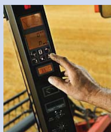
Typical ProTek Weatherable Application (Table 1-1)

Providing a certified 2000 hours of simulated weathering in a Xenon arc chamber for every roll of film, ProTek Weatherable outperforms its closest competitors significantly.