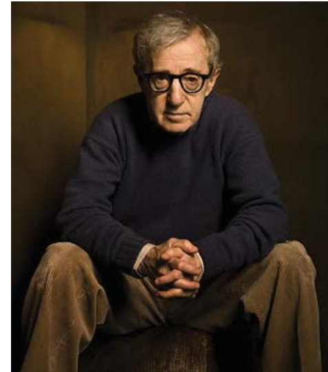
"Eighty percent of success is showing up" - Woody Allen